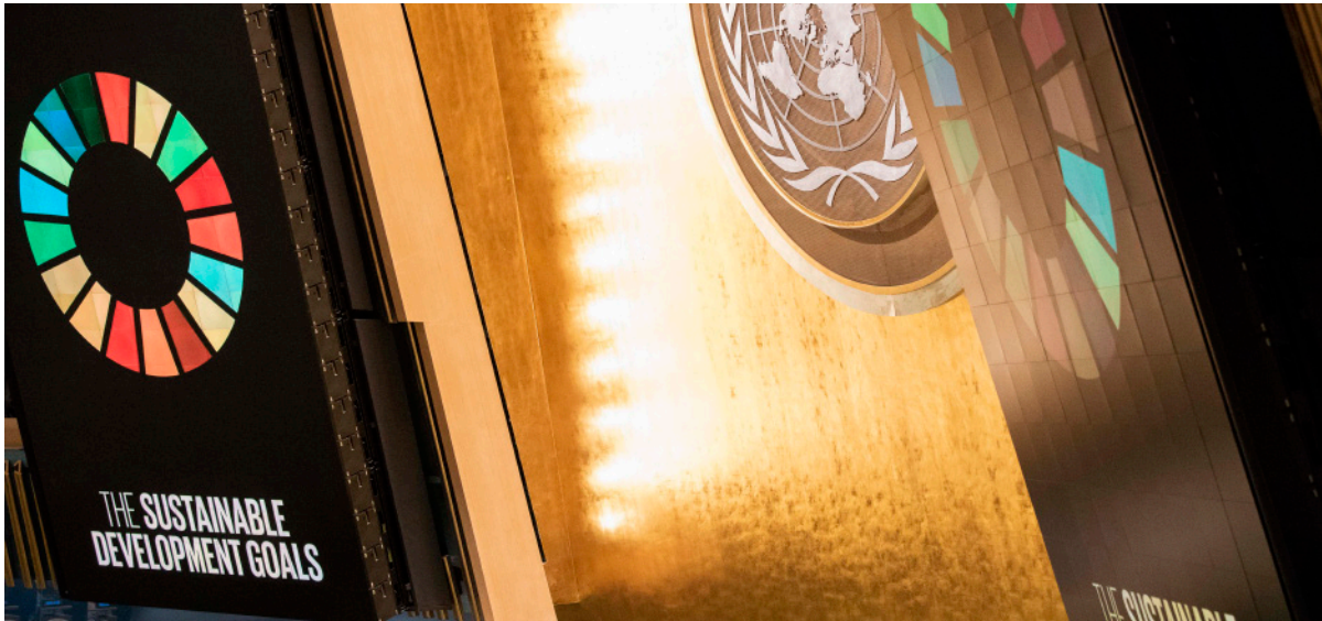
General Assembly opens seventy-third general debate.

for young people. Capacity development is required in engineering, scientific and technical disciplines, and also across all areas related to water and sanitation, including in policy, law, governance, finance, information technology, environment, gender, stakeholder participation and management. This includes strengthening the capacity of local governments and water and sanitation providers in water and sanitation service delivery.