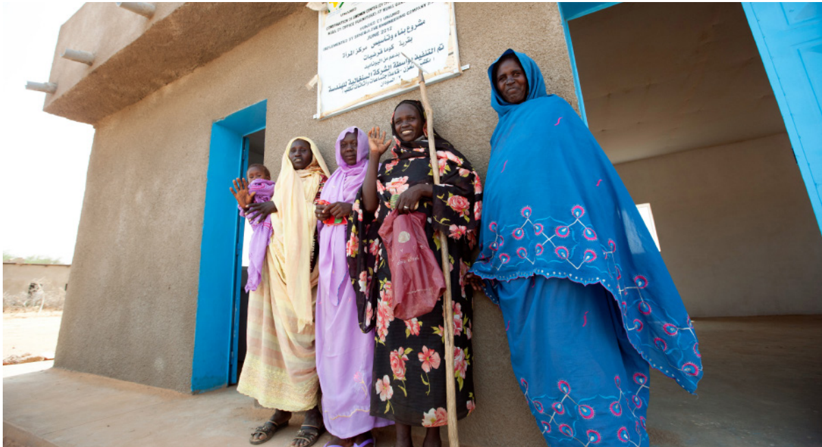
Women gather at a women's centre in Kuma Garadayat, Darfur, which has been developed in the areas of education, sanitation, health, community development, and the empowerment of women.