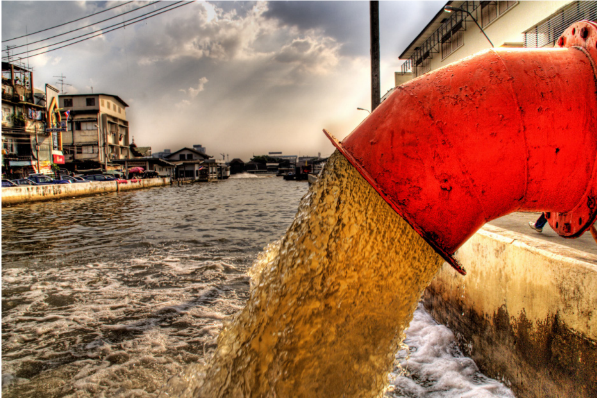
Sewage poured into a river.